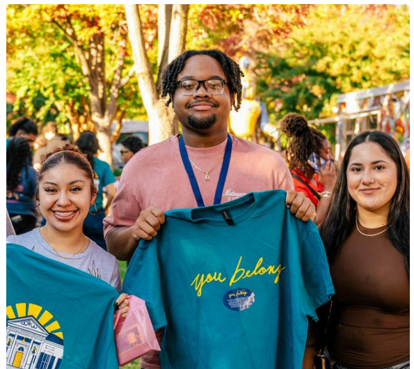
Spartan Family Weekend/Homecoming